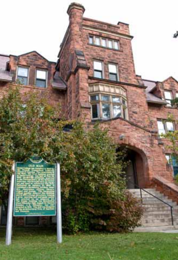
“Old Main” is the oldest building on the Finlandia University campus. It was erected by Suomi College, Finlandia’s predecessor, in 1898. Jacobsville sandstone, quarried at the Portage Entry of the Keweenaw Waterway, was brought by barge, cut and used to construct Old Main. Today, the building houses Finlandia’s administrative offices.