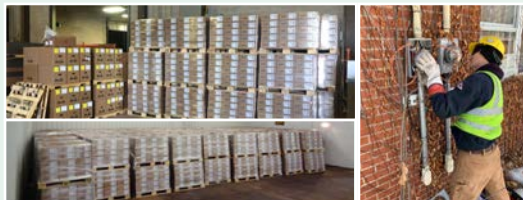
Pictured: Two shipments of smart meters have arrived and our meter technicians are ready for installation to begin in the fall!

The Smart Energy data, that will be available to some as early as this fall, can help you manage your energy use. You will need an Online Account (free to sign-up) to view the data associated with your account/smart meter(s). To register for online access to your UPPCO account visit www.uppcocom and click the white button for NEW ONLINE ACCOUNT .