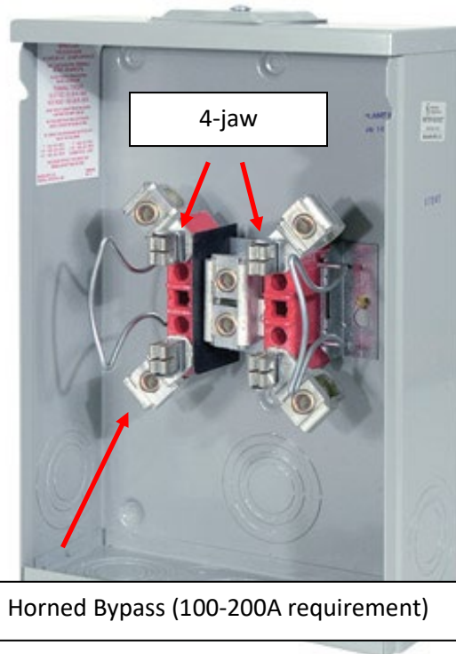
Horned Bypass (100-200A requirement)